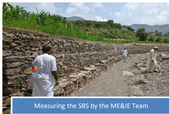
Measuring the SBS by the ME&IE Team