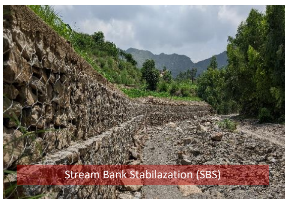
Stream Bank Stabilization (SBS)

Length: 191ft Top width: 2ft Bottom width: 8ft Height: 8.5ft Cultivable Area: 4-kanals