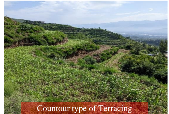
Countour type of Terracing

The extra output resulted in better living standards and generating valuable by product for their cattle as well in the process.